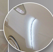
Dents & Dings