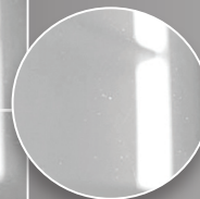
Windshield Star Cracks