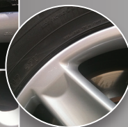
Cosmetic Wheel Repair