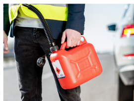
FUEL & FLUID DELIVERY